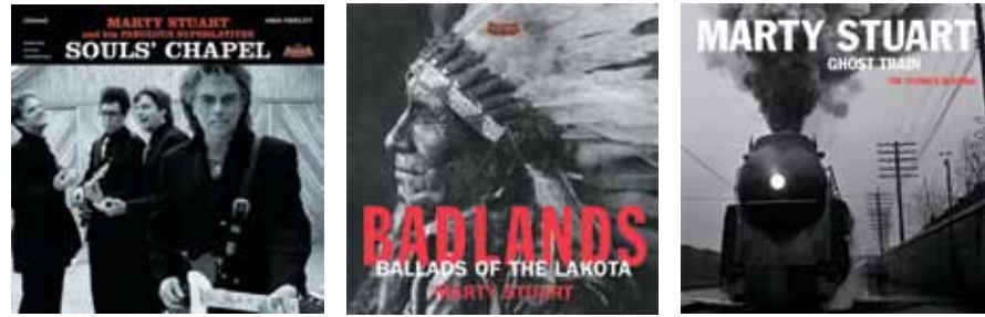
(Above) Marty’s albums Souls’ Chapel , Badlands: Ballads of the Lakota and Ghost Train: The Studio B Sessions are the result of his role as a cultural missionary; (below) The Marty Stuart Show , which has begun its third season on cable/satellite channel RFD-TV, is a traditional country fan’s dream.

One of the Grammy-nominated pieces on the album, “Hummingbyrd,” is doubly special to Marty, since it is a tribute to former Byrds guitarist Clarence White. The tune features