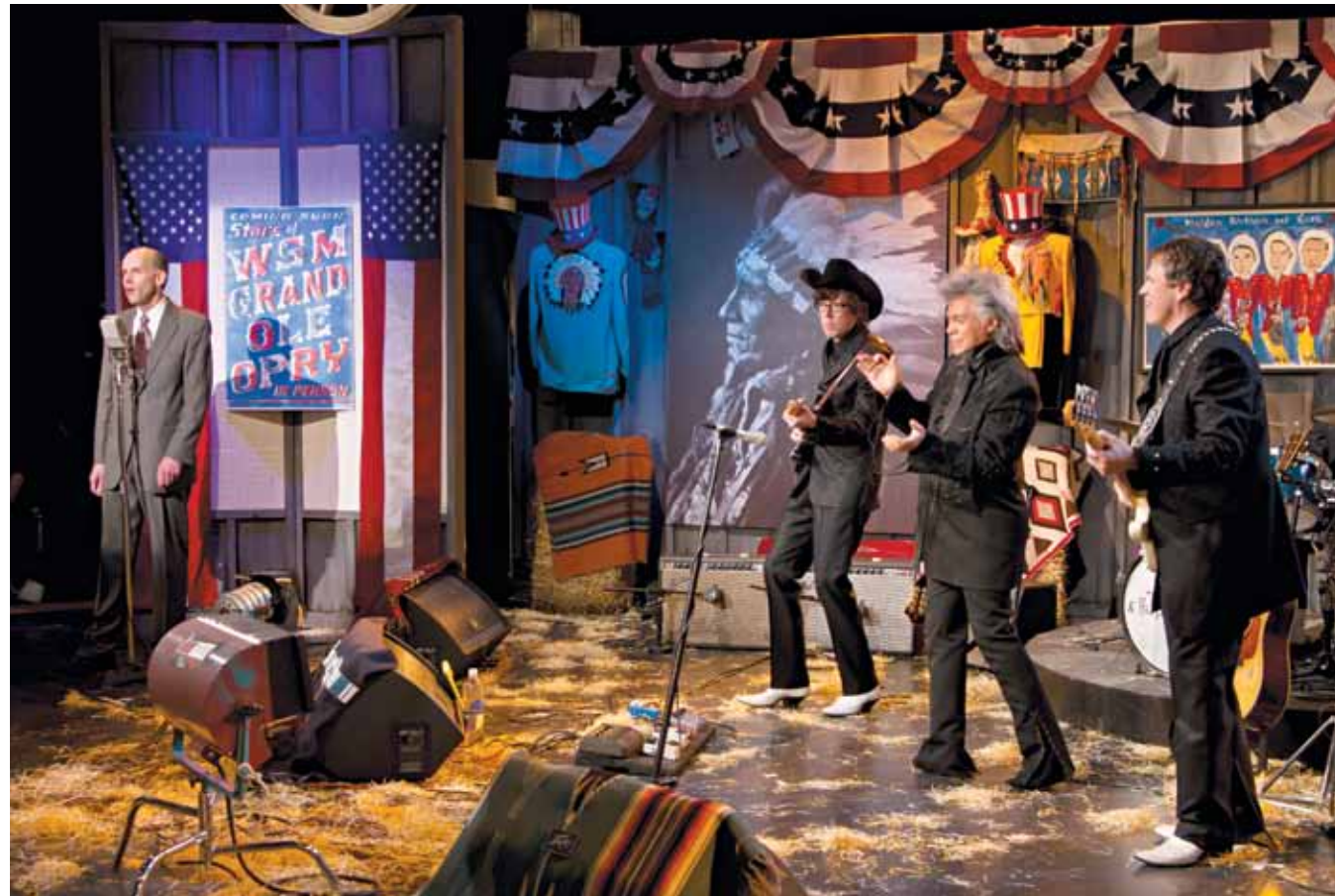
MARTY (IN MS) MARTY & CONNIE

Clarence’s actual guitar on the song. “There’s a lot of weight and responsibility that comes with that guitar, because Clarence was such a master musician. I’ve never felt like I had come up with my recital piece for that guitar, and ‘Hummingbyrd’ came along and his old bandmate, Gene Parsons of The Byrds, we played in Napa and I asked Gene if he would come to our concert. I played him “Hummingbyrd” before I played it for anybody else. Gene gave me thumbs up on it, so that gave me the confidence to go forward with it.”