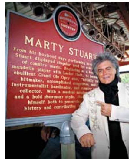
(Above) Marty was honored with a marker on the Mississippi Country Music Trail in 2010; (below) Marty celebrates his 50th birthday with wife Connie Smith at the Ernest Tubbs Record Shops Midnite Jamboree in 2008.

“The thing about Mississippi when it comes to creativity is [that] about all you have to do is turn a camera on down there and aim it in any direction, and there’s something to hear or see,” he says.